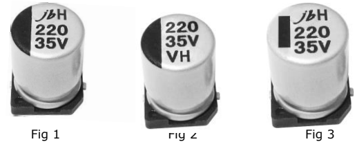
Note: Fig 1 & 2: Diameter 4 ~10mm Fig 3 : Diameter: ≥12.5mm

Operating Temperature -40°C ~ +125°C Voltage Range 10V~63V.DC Capacitance Tolerance ±20% at 120Hz, 20°C Leakage Current The greater value of either 0.01CV or 3μA Condition: μA/after 2minutes (max)